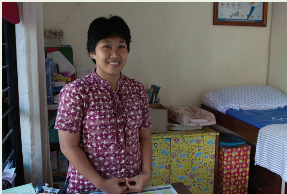
Midwife in a typical Andalan clinic room

Midwives perform a range of clinical services, and their roles have changed and developed over time. In 1996 the MOH established regulations for midwives' areas of practice that included care for children under age 5, preventive services and family planning. In 2002 the regulations were expanded to include active management of the placenta and emergency obstetric case management including home and facility-based deliveries, hemorrhages, preeclampsia and asphyxia. Although midwives are permitted to provide emergency obstetric care and active management of third-stage labor, there is a lack of clarity on which services midwives are allowed to provide (for instance, they are prohibited from administering uterotonic substances). Similarly, although midwives have been able to provide reproductive and family planning services since 2010, there is no regulatory framework covering the provision of IUDs and implants by midwives.