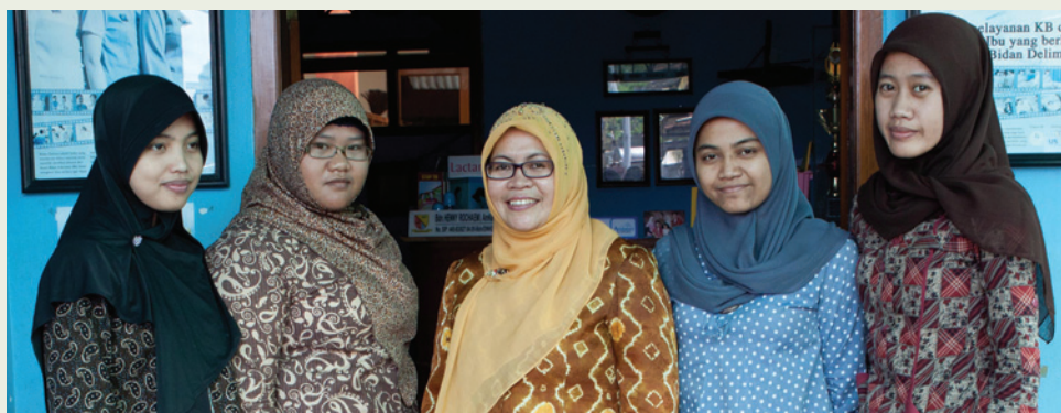
Midwives at an Andalan clinic

Indonesia has 7,000 OBGYNs 7 and over 250,000 midwives (40,300 of whom operate privately or semi-privately). 8 There are an estimated 20.4 nurses and midwives per 10,000 population, 9 compared to only 2.9 physicians per 10,000 population. The majority of physicians and OBGYNs prefer to work in major metropolitan areas—over half of the obstetricians practice on the island of Java—while midwives practice throughout rural and urban areas. Midwives provide more affordable care than physicians; for example, an IUD insertion at a midwife's private practice costs approximately $20 USD compared to $40 USD or $50 USD or more at a physician's practice.