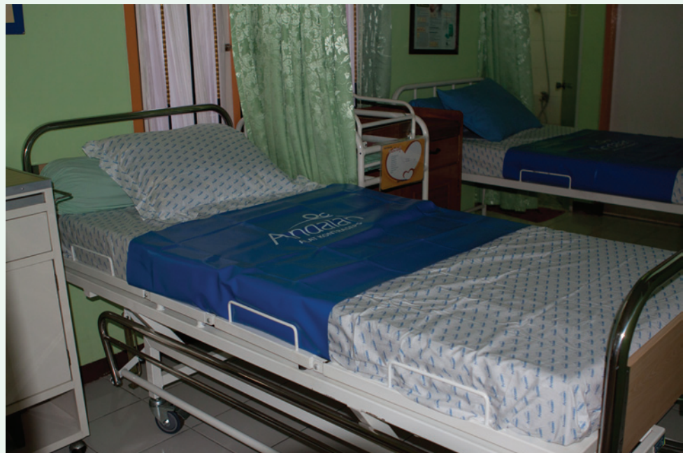
Andalan branded bed sheets

Midwives report that the main benefits of joining the program are the cash-back incentive and the affordable prices of the products offered by the franchisor. Furthermore, the fact that Andalan offers a full range of contraceptive products is appealing compared to other private-sector manufacturers who may only offer one or two products. Neon clinic signs and promotional products including Andalan-branded towels, bed sheets, and signs are also valued by the franchisees. Midwives report that being able to pay for the products on credit is a benefit that not all other product suppliers offer. Some midwives also perceive that the TV, radio, and print advertising of the Andalan brand draws clients to their business while strengthen their position as qualified health care providers.