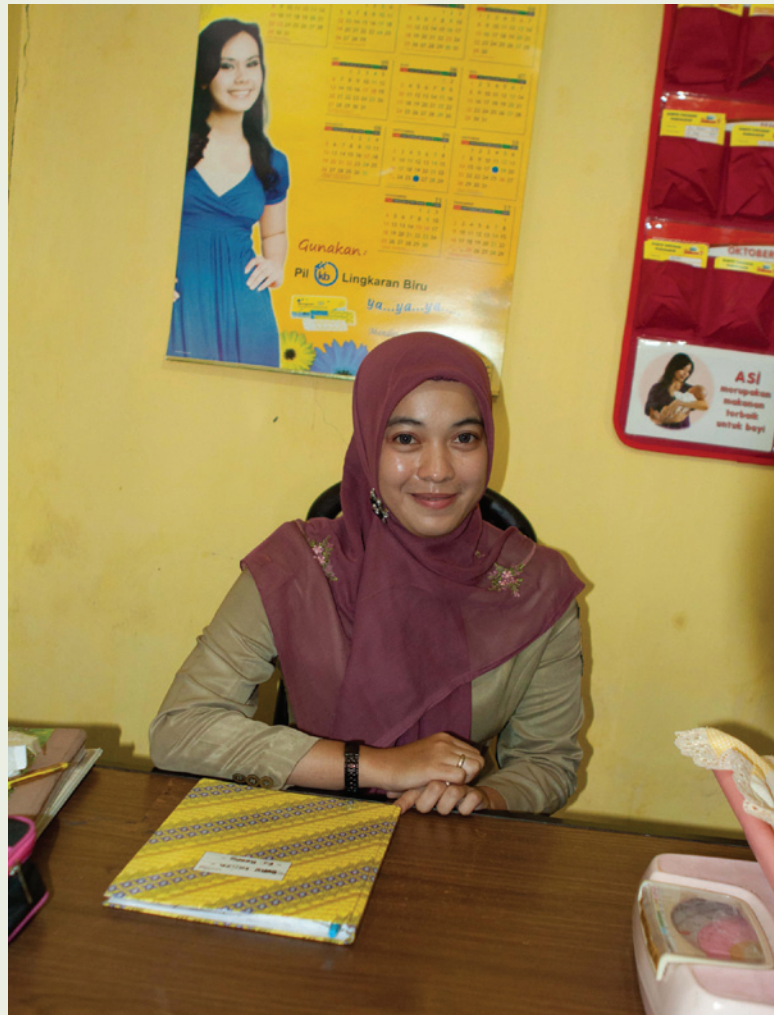
Andalan rural midwife

to midwives who may face challenges with the local police due to working outside the regulatory framework. It also works to improve the status of midwives among policy makers by challenging laws or regulations that aim to limit the role of midwives in the health system. The IBI headquarters is in Jakarta; it also has 33 province-level offices and 456 district-level offices. Local chapters run regular meetings, offer practice-based health seminars (e.g., IUD insertion training), and hold training on theory, practice, and policy issues. Midwives pay a monthly membership fee to help pay for organizational costs.