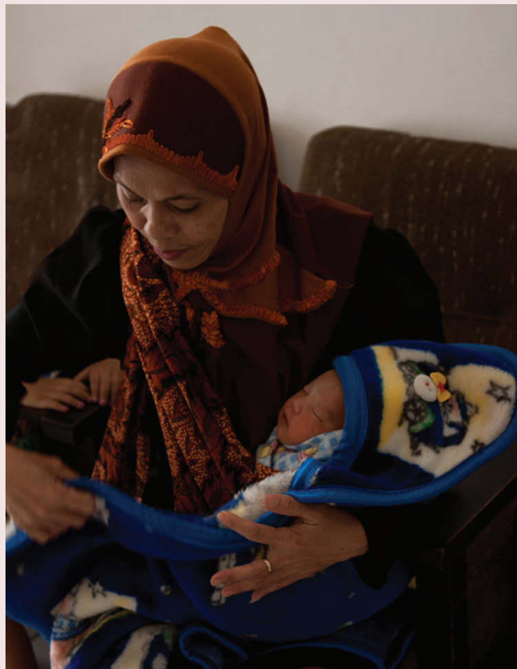
Woman visits midwife for antenatal care

The majority of clients receiving franchised services receive injectables. Women visiting an Andalan midwife to receive an IUD typically have three or more children or do not tolerate hormonal contraceptives well. Midwives report that about half of IUD clients arrive at the clinic knowing that they want an IUD, while others select an IUD after counseling.