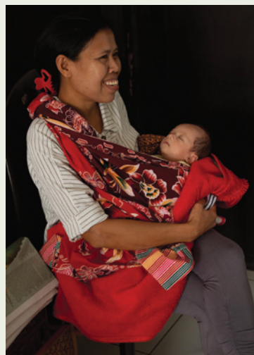
Andalan client with her newborn baby

Indonesia faces significant health challenges. Life expectancy at birth is 72 years, ranking 135th in the world, and the country's health expenditures rank 128th in the world, accounting for just 5.5 percent of GDP. 2 Maternal and child health remains a major health issue in Indonesia. The maternal mortality rate (MMR) is one of the highest in the region at 228 deaths per 100,000 live births, although this rate is declining. 3 The infant mortality rate is also high, at 27 deaths per 1,000 live births. There are significant regional and socioeconomic inequities in maternal and child health outcomes. 4 For example, while nationwide a majority of births are attended by a skilled provider (73 percent), skilled birth attendance ranges from 97 percent in Jakarta to only 33 percent in Maluku. 4 In addition, only 63 percent of rural Indonesians and 44 percent of Indonesians in the lowest income quintile report birth attendance by skilled providers, compared to 88 percent of urban residents and 95 percent of Indonesians in the highest income quintile. 4