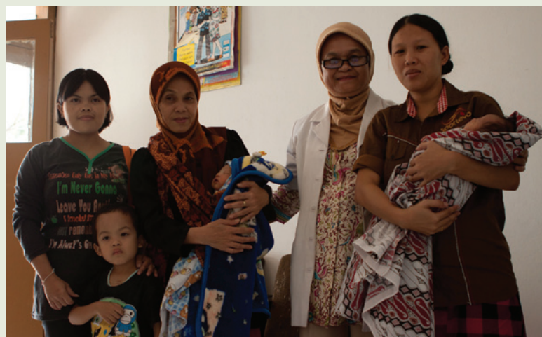
Clients visit a midwife franchisee for antenatal care in West Java

The typical franchisee sees 100 to 300 clients per month, of which approximately half are family planning clients. In addition to providing family planning products, the midwives provide a range of nonfranchised services including antenatal care, delivery, immunizations and general health care. Among their family planning clients, midwives report that injectable contraception is the most popular method—accounting for approximately two-thirds of contraception provided. Midwives have fewer IUD clients; most midwives insert between one and five IUDs per month. Many franchisees also volunteer to work at National Family Planning Board-sponsored long-term method camps where women can get a free IUD, implant or sterilization.