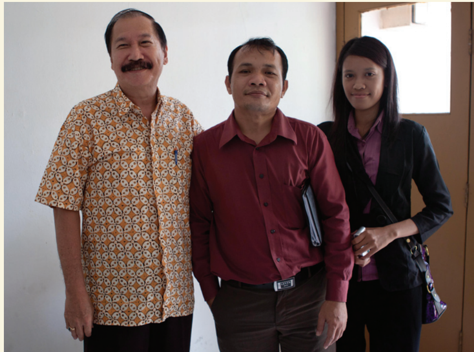
A manager from DKT headquarters, a sales manager and a midwife coordinator

The Andalan franchise program is managed by a small team consisting of seven staff members at the Jakarta headquarters. This team oversees four regional sales supervisors and eight district managers based throughout the country in offices with DKT's national distributor. The regional sales supervisors and district managers work directly with the distributor's sales representatives and also oversee a team of 34 DKT-employed midwife coordinators. The supervisors and managers ensure that the sales force and midwife coordinators have the required skills and knowledge to promote products to the franchisees. Each regionally based staff is responsible for delivering products to the midwife networks, engaging the midwives in sales contracts, providing promotional product information to franchisees, and organizing trainings. The sales representatives and midwife coordinators visit approximately 200 midwives a month and spend a minimum of 30 minutes on each visit. Midwives who purchase large volumes of products are prioritized and visited twice a month.