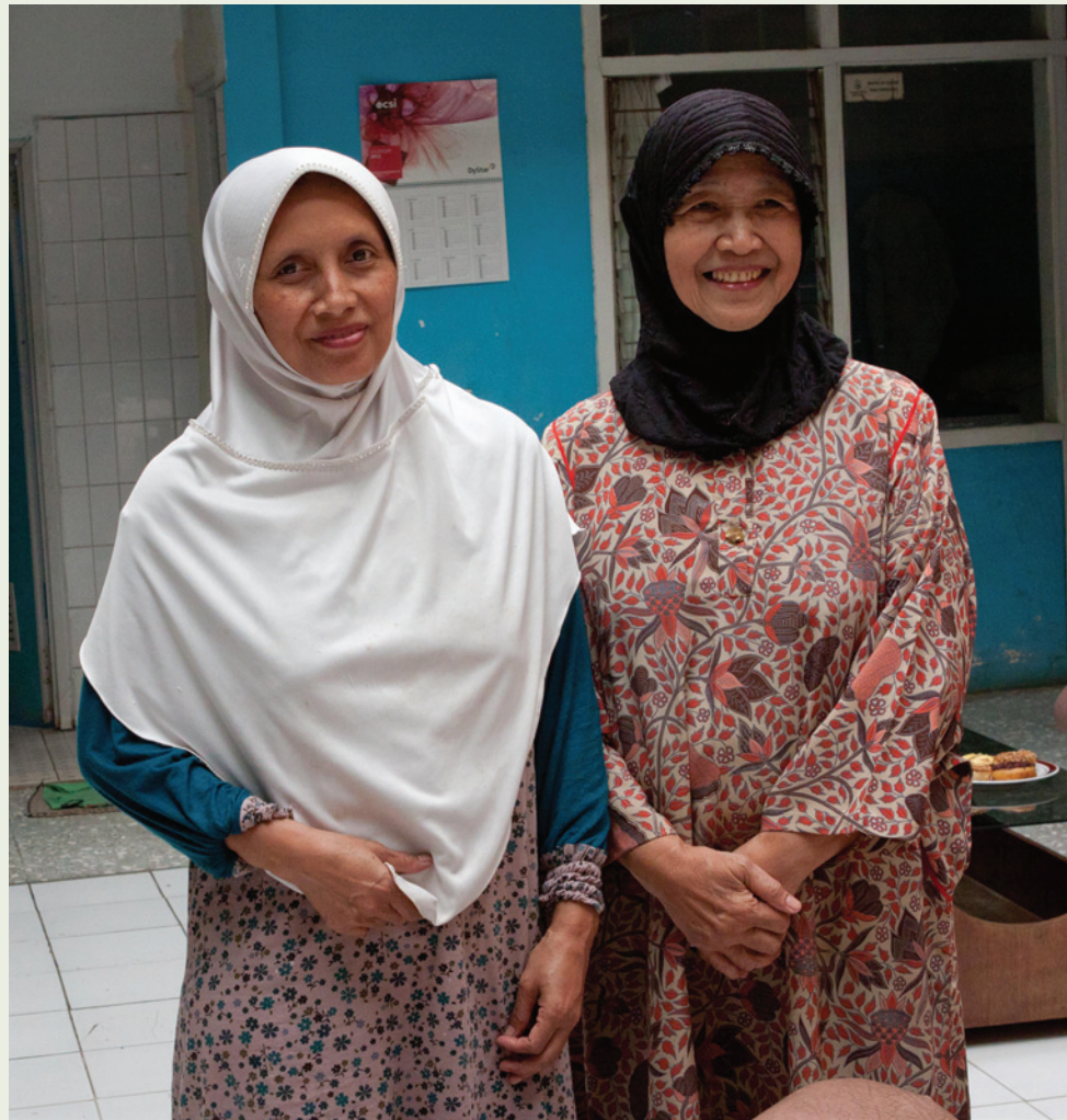
Midwives at an Andalan clinic

Midwives in Indonesia commonly work in both the private and public sector. Individuals must register as civil servants to work in the public sector, and this process can be costly. However, working in a government facility provides benefits such as health insurance and pension, and therefore government positions have become more competitive to secure in the past decade. Midwives often work in a local health center in the morning and open a private practice at night, typically in their homes. The benefits of a private practice include extra income and more flexible working hours. Midwives refer complicated delivery cases to OBGYNs.