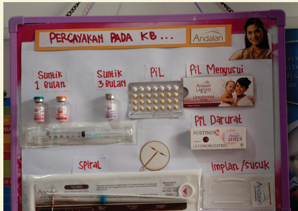
Andalan-branded products on display in midwife clinic