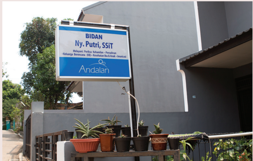
Andalan sign outside an Andalan clinic

The Andalan franchise is a one-stop option for high-quality family planning products, marketed through both above- and below-the-line activities. DKT began advertising for IUDs in 2008 and was the first to advertise IUDs on national TV, in print media, and on the radio. These efforts have increased the popularity of IUDs and have led to increased public-sector promotion of IUDs. This success comes despite the fact that marketing and advertising activities are restricted due to Indonesian regulations that prohibit the advertisement of family planning products on television before 10 PM. In response to this challenge, DKT created public service announcements that resemble existing advertisements and that can be aired during the day but do not show any products.