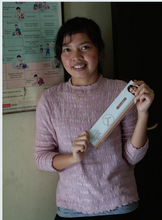
Midwife shows an Andalan-branded IUD

There are also barriers from the client side that make IUDs a less popular option than injectable contraception. Indonesian women, like women around the world, have fears and misconceptions about having an IUD. Many perceive that an IUD is uncomfortable and that it can negatively impact sex if the husband is able to feel it. Some in the largely Muslim population also believe that having a foreign body inside the uterus is not acceptable. Midwives report that husbands often discourage their wives from having an IUD for the same reasons—and because a husband is required to sign an informed consent before his wife has an IUD inserted, this is a significant barrier. The price of an IUD, at a cost of approximately $20 USD is also perceived as a barrier for low-income women.