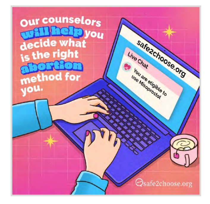
WFD's websites inform users and providers about abortion with pills and self-care procedures.

With over 1,000 points of care registered across 81 countries, safe2choose demonstrates its dedication to providing accessible and informed support to women globally. The safe2choose website is available in 10 languages and provides information on self-