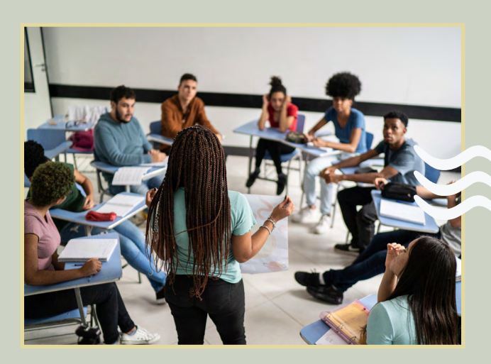
WFD conducts offline activities in universities and youth centers to increase awareness of abortion with pills.

We collect a wealth of data to understand how users prefer to navigate digital resources, and their journeys on our websites, and will continue to center our product features around user needs and preferences.