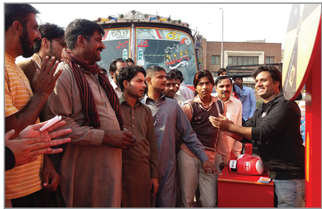
Educating men is critical to user acceptance of family planning.

Mass media, however, can only go so far in promoting family planning in Pakistan. Mass media cannot be used to advertise prescription products and can be problematic for hard-hitting condom advertising, as demonstrated by the two banned TV spots. Therefore, DKT also uses interpersonal communication.