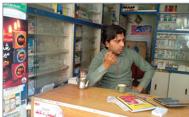
One of the many pharmacies in Pakistan where DKT sells condoms and other contraceptives.

DKT sells a variety of reproductive health products with the objective of promoting healthy spacing and timing of births. DKT ensures that these products are affordable in all corners of Pakistan through more than 50 distributors and widely dispersed networks. DKT puts these products into thousands of little shops on the side of the road, supermarkets and pharmacies.