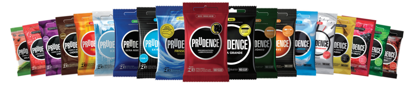
DKT's advocacy work reduced taxes and tariffs on all condoms, making DKT Brazil's Prudence brand cheaper and more popular than ever

As a result, most female condoms are now free of import taxes. Import duties on male condoms were lowered from 40% in 1993 to 13% in 2000, and averaged 10% in the decade that followed. Sales taxes (VAT included) were lowered from 36% in the early '90s to less than 4% today.