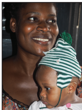
A mother and her child at a DKT family planning event in Lagos, Nigeria.