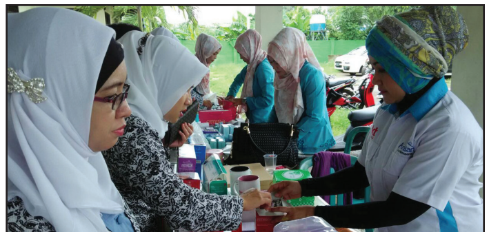
DKT Indonesia promoters (right) talk to midwives about DKT's line of contraceptive products at the anniversary of the Indonesian Midwives Association.

DONORS: DKT International gratefully acknowledges the generous support of donor organizations, foundations and governments. We pledge to be worthy of their trust. A list of major donors is available on our website. Donations to DKT may be mailed or made online here .