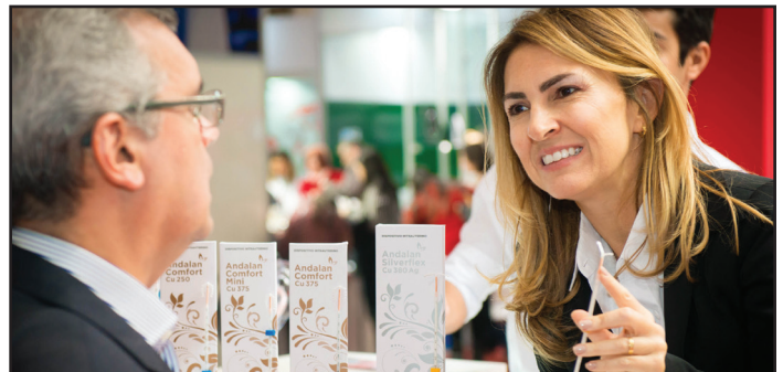
A DKT promoter discusses our line of contraceptives at a conference for obstetrician-gynecologists in Brazil.

"When I heard about DKT and their contraceptive methods, I decided to go for the contraceptive implant and since then, I have saved some money. Now I have a mini market at home and I'm busy building a house so my family and I can have a good life."