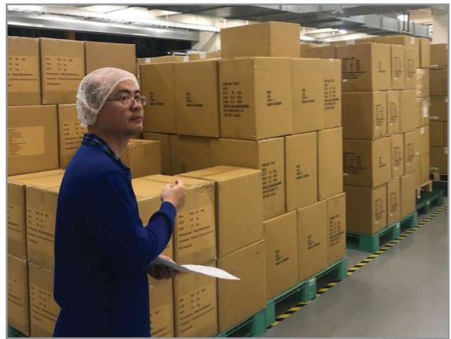
DKT WomanCare seamlessly connects customers with high-quality products.

DKT WomanCare maintains its own US FDA-cleared Quality Management System and has deep expertise and experience with quality control and quality assurance. The quality assurance team works