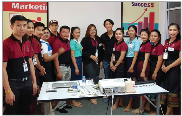
DKT WomanCare builds the capacity of partners to reach new family planning users and provide more choices.

Through our WomanCare Academy platform, we develop easy-to-use clinical training materials in multiple languages to build the capacity of healthcare providers delivering products and services to women. Our local partners organize trainings for healthcare providers so they can offer more options for women with competence and confidence.