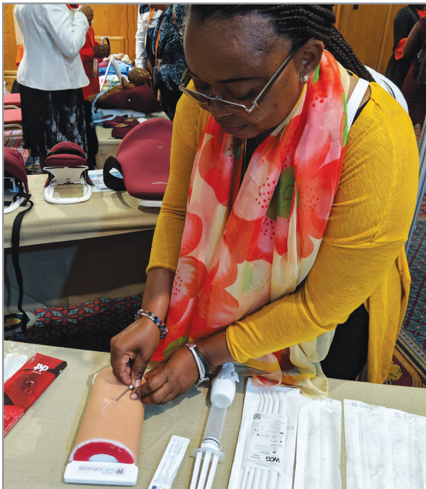
DKT WomanCare trains healthcare providers to confidently deliver new family planning products and provide quality care.

Our marketing team develops educational materials to expand awareness of our products and highlight their benefits. We develop communication materials that encourage women and their healthcare providers to have conversations about fertility and options. We work with in-country partners to market our products and emphasize the salient features important to clients in that country.