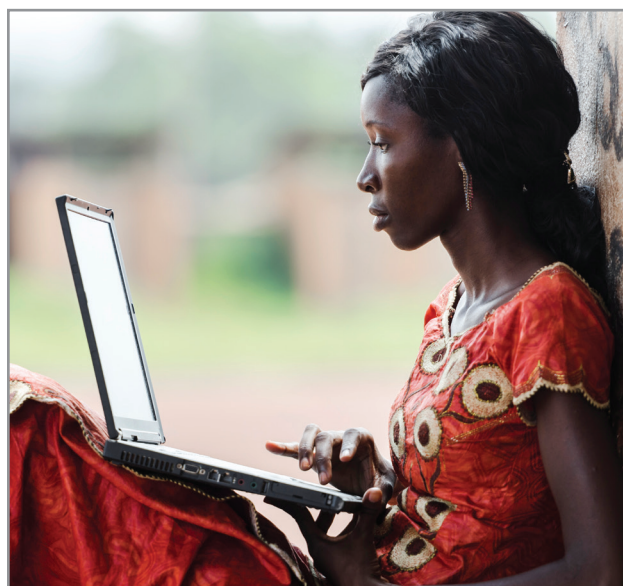
DKT partners with educational websites, like HowToUseAbortionPill.org , to inform end-users and providers about the abortion pill and self-care procedures.