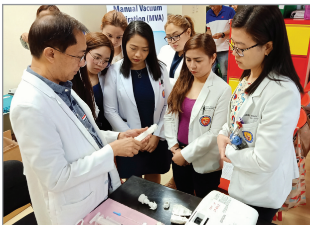
DKT trains thousands of providers each year, ensuring they are educated on medical abortion pills and the MVA technology.

importance of offering safe abortion and post-abortion care services. In addition, the visit becomes a teaching moment to refresh product providers' knowledge of proper usage, normal symptoms, and adverse drug reactions. DKT also equips service-delivery and product providers with technical product information, easy-to-understand diagrams, and answers to frequently asked questions. In countries where provider intervention is not required, DKT de-medicalizes abortion, ensuring women may easily access the product and accurate information via in-person and online with instructions for self-care.