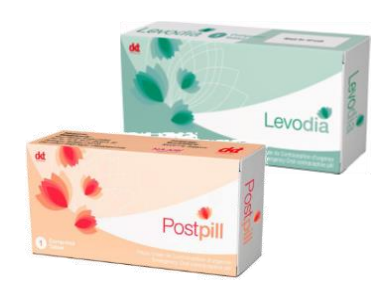
DKT's low-priced EC brands, Postpill and Levodia

It's true that DKT has gained substantial market share, but this has been accompanied by overall market growth and crowding in of other actors. DKT's strategy has been to show the market potential for low-cost brands to other suppliers. Analysis of market research company IQVIA data reveals that the number of individual, discrete EC brands in the marketplace has increased by 32% from 73 to 96 between 2018 and 2022. Other private sector actors have been attracted by the growing market and see the potential for profit. We can see this effect at a national level in the example of Mali below.